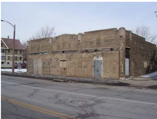
Avenues West Project Boundary

Do you want to be part of the SOHI Mainstreet District? If so, the Redevelopment Authority of the City of Milwaukee (RACM) and the SOHI Mainstreet District want your proposal to purchase and redevelop the commercial building at 2622-26 West State Street – a prominent site in SOHI. Check out the SOHI happenings at http://www.westendmilw.org/sohidistrict/main.htm . You'll also be a part of the Avenues West Business Improvement District and the Avenues West Neighborhood Plan with great proximity to Historic Concordia. More neighborhood information is available at: http://www.mkedcd.org/purchasingpower/pdfs/53233.pdf