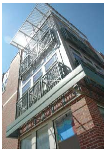
Toussaint Square 3405 W. North Ave.

Construction was completed in 2007. The project includes 24 units and approx. 5,000 sq ft of retail space.