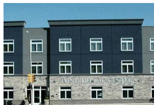
Fond du Lac Center 2708 W. Center St.

Marketing is ongoing. Two of the three homes are sold and occupied.