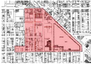
20th & Brown TID North/Fond du Lac/Brown/23rd

The 20th & Brown Tax Incremental District (TID) was approved in 2006. The TID funds $3.1 million of public infrastructure, site acquisitions, and remediation costs and provide loans/grants for rehabilitating existing homes. Legacy Development Partners plans to develop the area with up to 60 detached single-family homes and 24 townhouses.