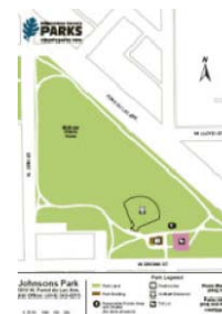
Johnsons Park 20th/Fond du Lac/Brown

Developed by the North Avenue Community Development Corp. with construction completed in 2006, Toussaint Square is a mixed-use building with 24 residential units and 12,000 square feet of ground floor office/retail space.