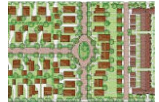
Josey Heights 14th/Lloyd/12th/Brown

Walnut Way Conservation Corps received a $1 million Zilber Neighborhood Initiative Award to help transform the 30 block area surrounding its original sustainable neighborhood. Through the Walnut Way Conservation Corps, $19 million of private housing investment has supported the development of 125 new homes, 142 rehabilitated homes, a neighborhood center, and 42 rain gardens.