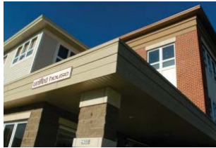
United House 2500 W. Center St.

Prince Hall, a 24-unit mixed-use development was completed in 2008. The apartments, funded using Low Income Housing Tax Credits, are fully leased. Commercial space is also fully occupied.