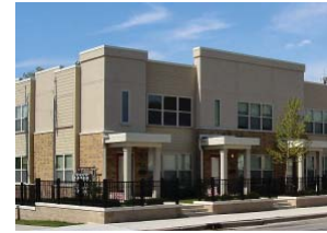
Prince Hall 1210 W. North Ave.

The 20th & Brown Tax Incremental District (TID) was approved in 2006. The TID funds $3.1 million of public infrastructure, site acquisitions, and remediation costs and provide loans/grants for rehabilitating existing homes. Legacy Development Partners plans to develop the area with up to 60 detached single-family homes and 24 townhouses.