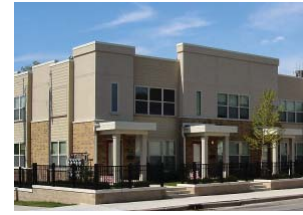
Prince Hall 1210 W. North Ave.

The 20th & Brown Tax Incremental District (TID) was approved in September 2006. The City's DPW has completed a portion of the public improvements, with the balance expected to be done by Dec. 2009. According to Milwaukee County, berm removal in Johnsons Park is scheduled for Spring-Summer 2009. The developer is planning their marketing strategy and assembling builders for the project.