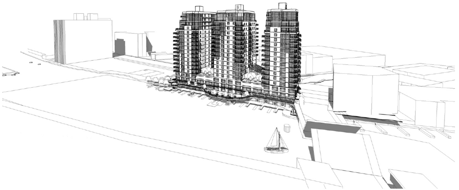
From NW Across River

PLEASE NOTE: Upon reasonable notice, efforts will be made to accommodate the needs of disabled individuals through sign language interpreters or other auxiliary aids. To request this service, contact the Department of City Development, 809 North Broadway, Milwaukee, WI 53202, telephone 286-5939.