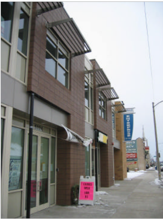
The Burleigh Street Community Enterprise Center has retail and community meeting space.