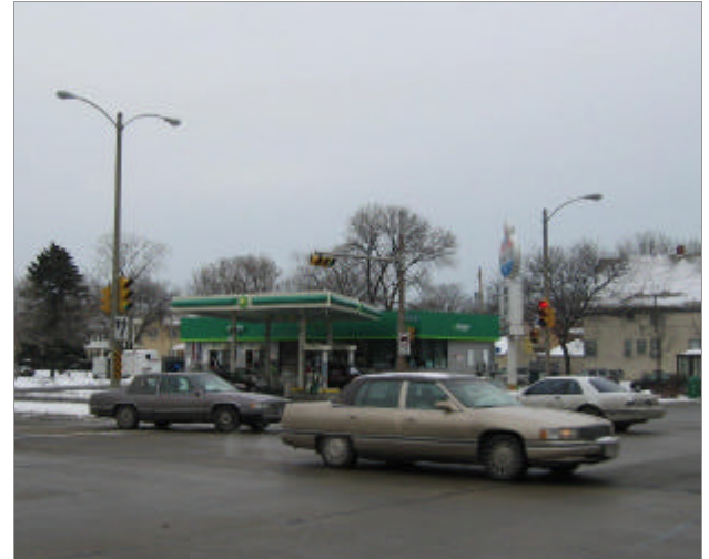
This Amoco/BP station (right) serves many of the 40,000 potential customers that pass it every day.