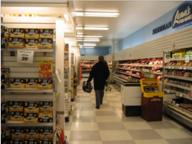
Lena's Sherman Park Food Market (left) serves neighborhood residents with full-service grocery.